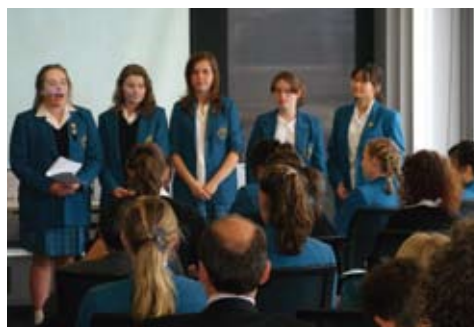
Students from Wellington Girls' College presenting at the BP Awards ceremony