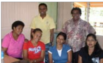
Principal and Teachers from Rambisessar Chaudhary Primary School