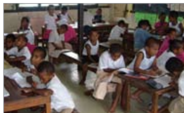
Junior class at Nausori District School

The Young Enterprise Trust has been involved in several initiatives to support the Pacific, originating from the 2008 Coombs Declaration, emanating from the meeting of Finance Ministers, Central Bank Governors and Senior Officials from the Pacific area (including New Zealand). This conference, sponsored by the ADB, IMF, IFC, RBA, UNDP and the World Bank, was about deepening financial capacity in the Pacific region.