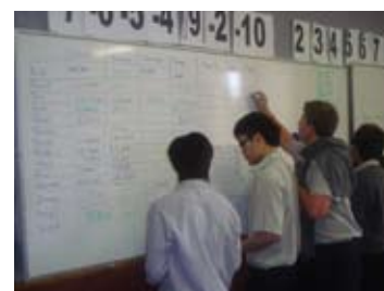
Students recording their investment results after playing the game