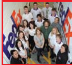
FedEx Express/JA Trade Challenge semi-finalists at FedEx headquarters