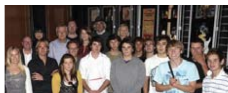
Students attend an Enterprising Music Workshop in Auckland

A workshop was organised in the school holidays so that students could learn about all aspects of the business. Representatives from SONY music, a concert promoter, music