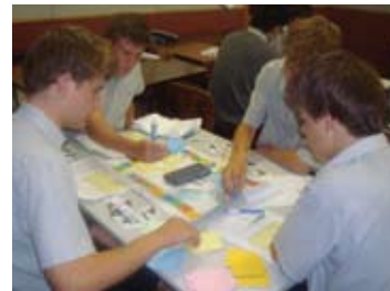
Wanganui Collegiate students trial the game

Sounds like a good way to learn an important life skill!!! Register now. Download the registration form at www.financialeducation.org.nz and select Professional Development.